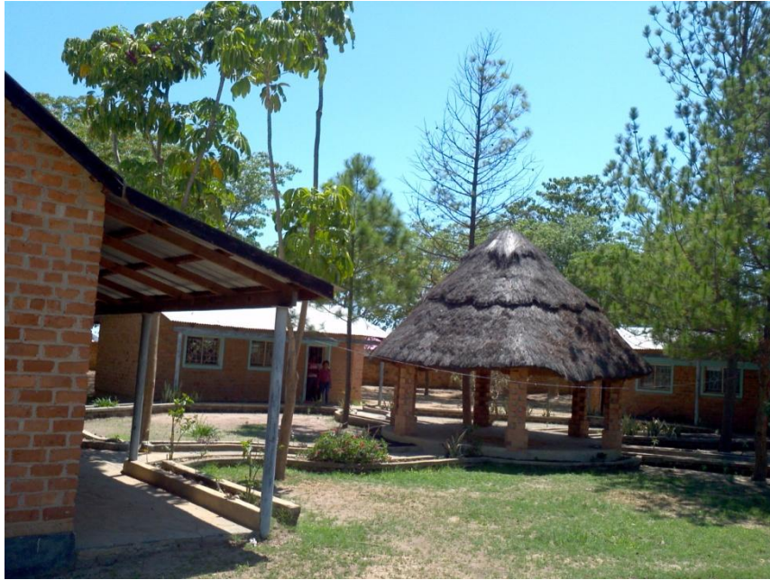
Main campus- Kabsy School of Domestic Workers.